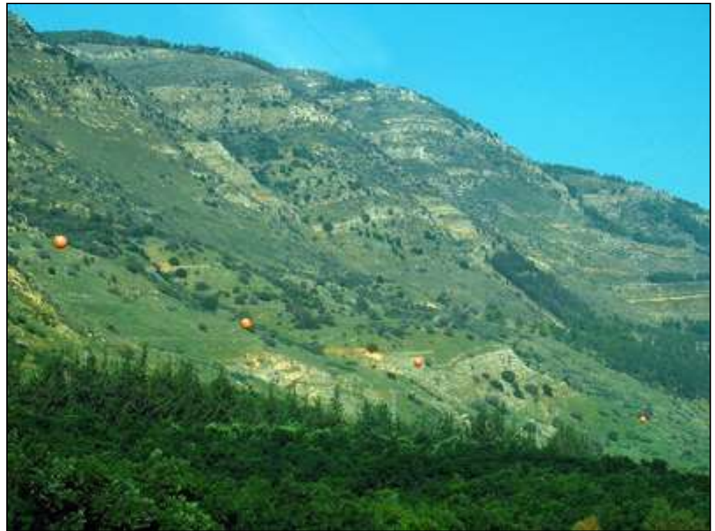
Location of Sermon on the Mount.